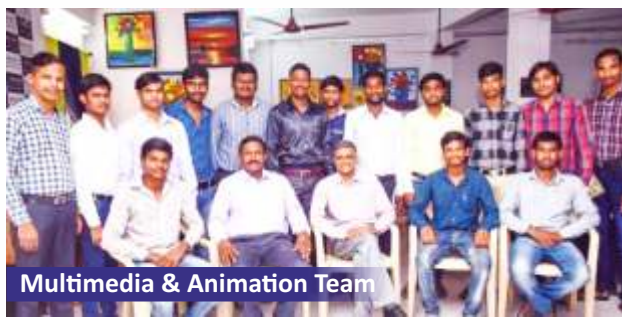
Multimedia & Animation Team