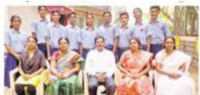
ఉత్తీర్ణత సాధించిన విద్యార్థులతో పంపి ఉపాధ్యాయులు

Volume 1 Sat., 24 July 2009 0000-0000 0000-0000