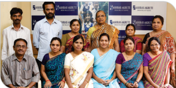
SUPPORT STAFF RESIDENTIAL