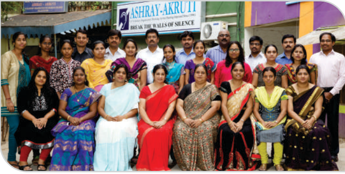
ADMINISTRATIVE STAFF SRINAGAR COLONY