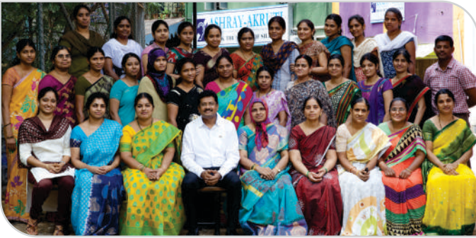
TEACHING STAFF SRINAGAR COLONY