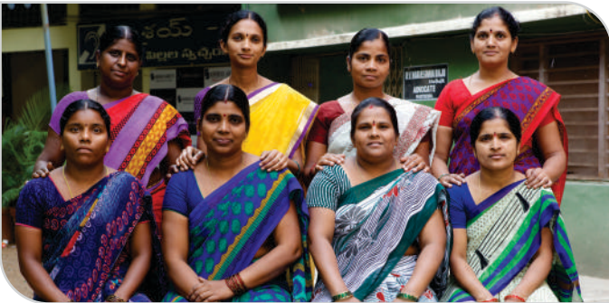
SUPPORT STAFF SRINAGAR COLONY