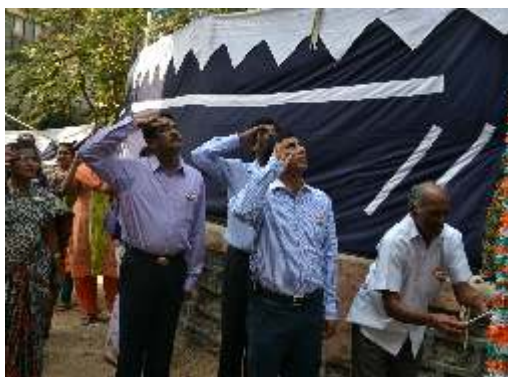
Republic Day celebrations