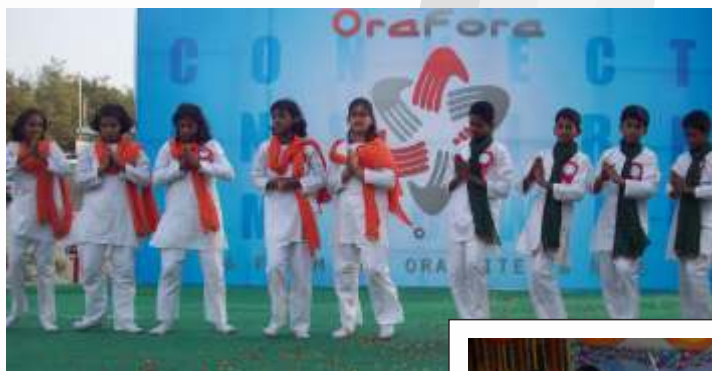
Students performing at the Oracle Event

Ashray Akruti participated as one of the charity partner at the Jamba Cloud Hyderabad 10 K Run held on 25 th November 2012.