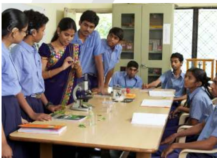
Students at the Science Lab