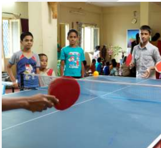
Students enjoying playing Table Tennis