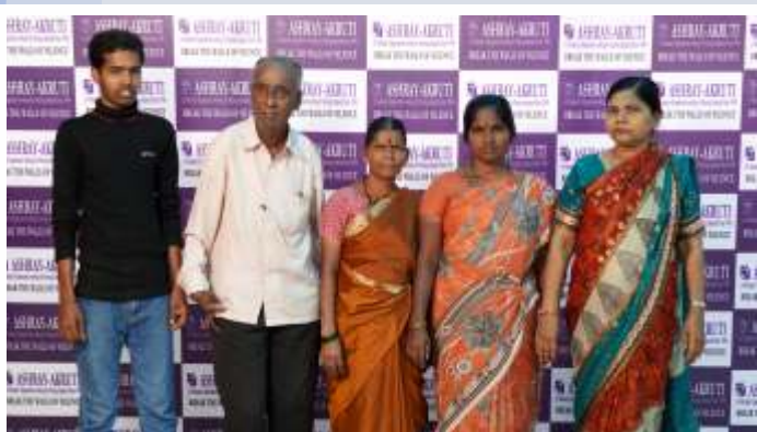
SUPPORT STAFF YAKUTPURA