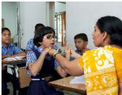
Speech Therapy Session