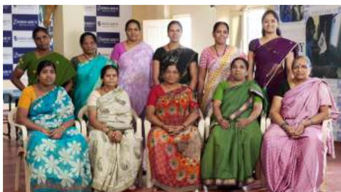
SUPPORT STAFF RESIDENTIAL