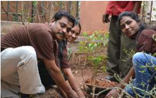
UPS Volunteers at Ashray Akruti