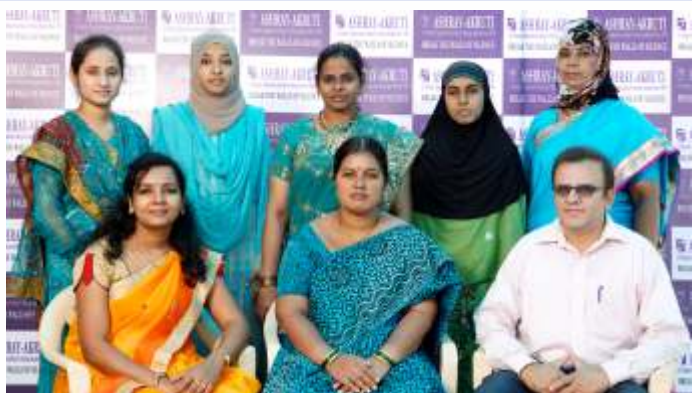
TEACHING STAFF YAKUTPURA