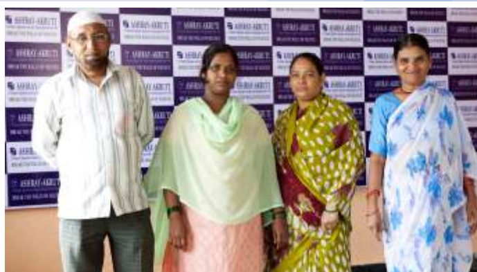
SUPPORT STAFF CHANDRAYANGUTTA