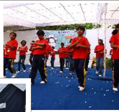
World Disability Day