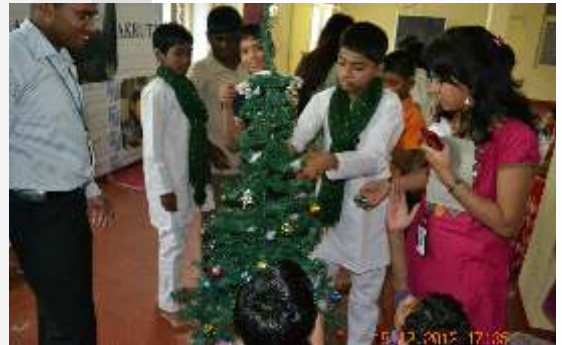
Wipro Volunteers at the hostel