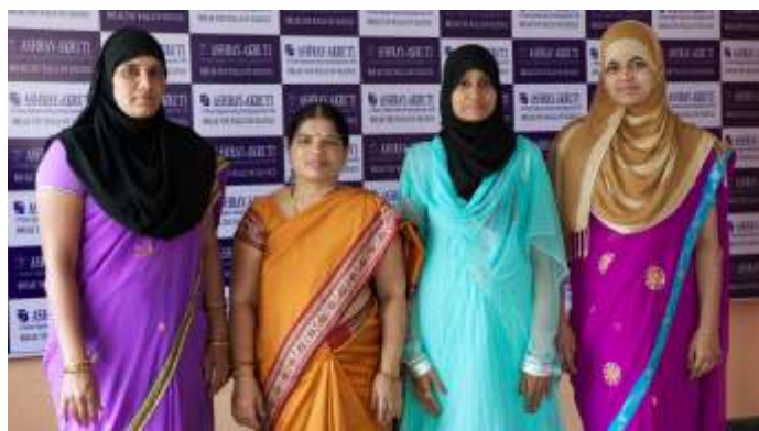
TEACHING STAFF CHANDRAYANGUTTA