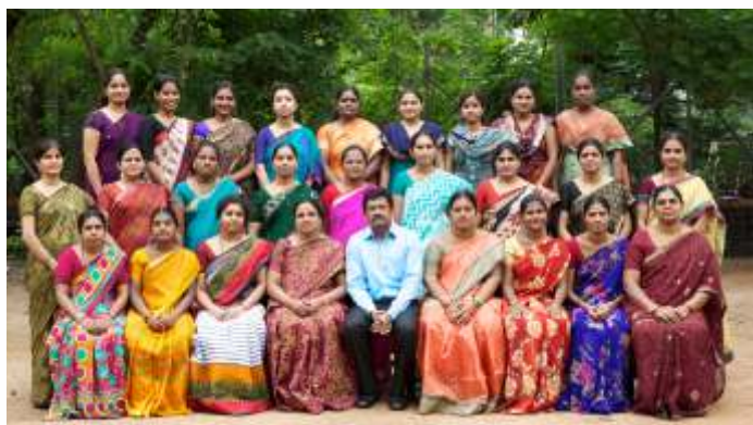
TEACHING STAFF SRINAGAR COLONY