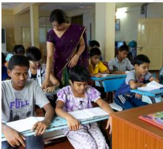
Study time at the hostel