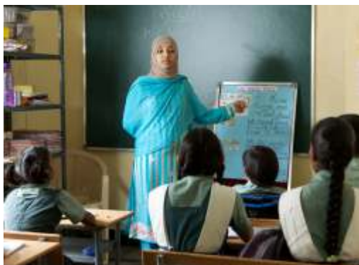
Class in Progress