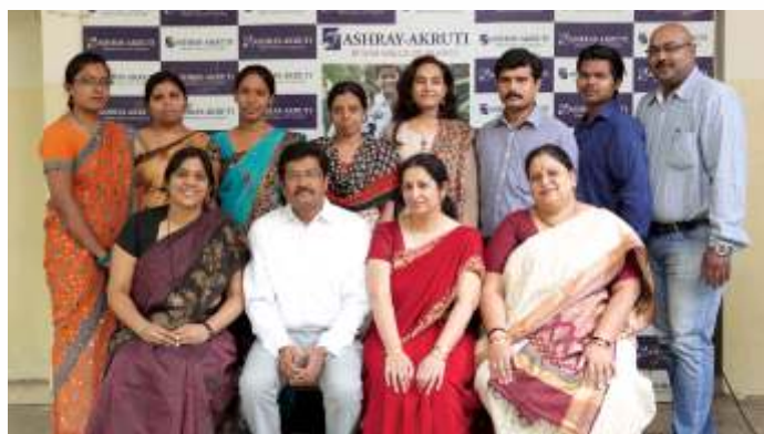
ADMINISTRATIVE STAFF SRINAGAR COLONY