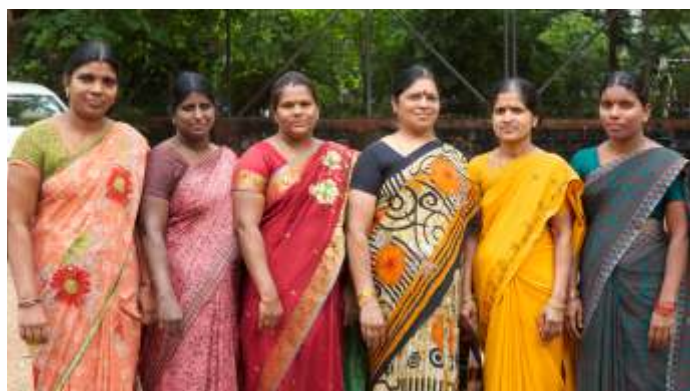
SUPPORT STAFF SRINAGAR COLONY