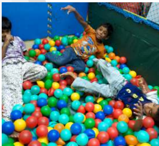
Leisure time at the hostel