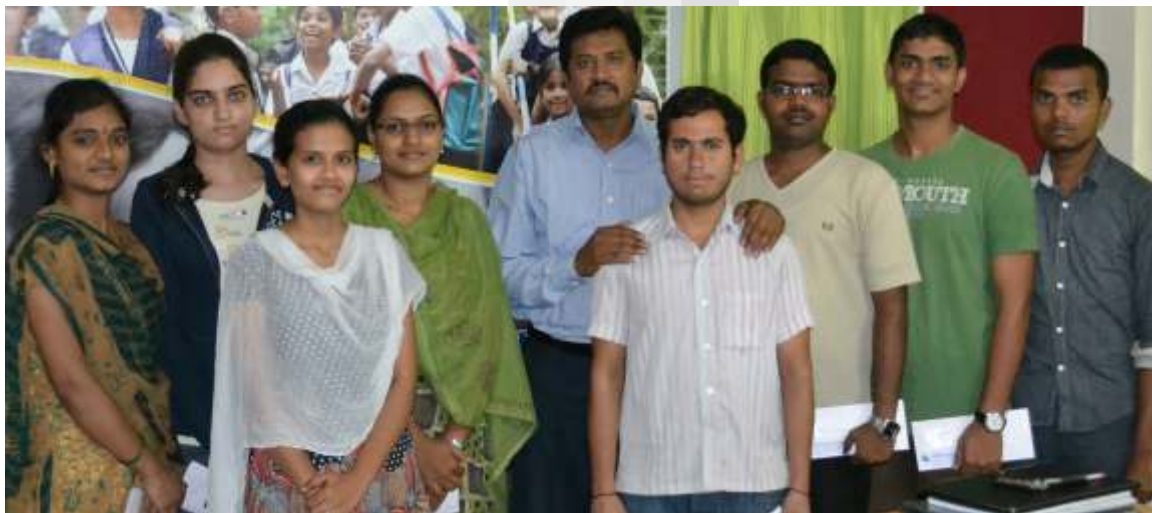
Students of the Multimedia Course with the Director

Most of the students who hail from poor backgrounds initially had no knowledge of computers or English before joining Ashray Akruti. During their tenure of two years at Ashray Akruti, the students were trained in Photoshop, CorelDraw, Illustrator, 2D (graphic design, animation), 3D (modeling, texturing, rigging, animation), and web designing. Post the course, they also worked for projects earning a stipend before the placements.