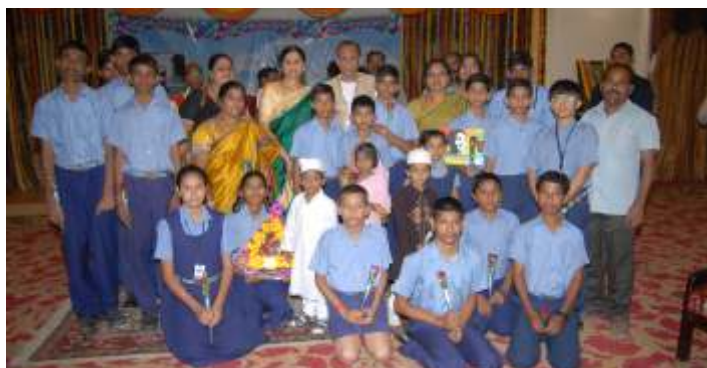
Ashray Akruti students with the Hon Governor on Children's Day