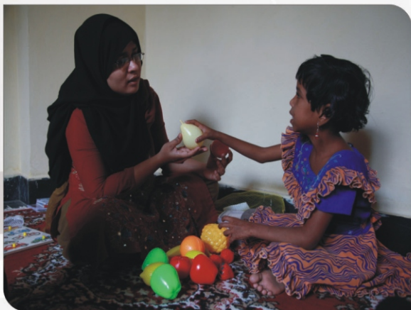
Class Room Session in Chandrayangutta

The Students of Ashray Akruti came out with flying colors at the State Board Examination (Xth Std). All the ten students were placed in distinction, three students securing 95%. It was a moment of great achievement for the students as well as for the Organization.