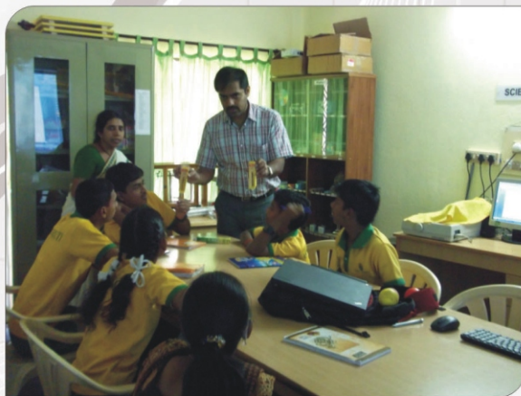
Science Lab and Library