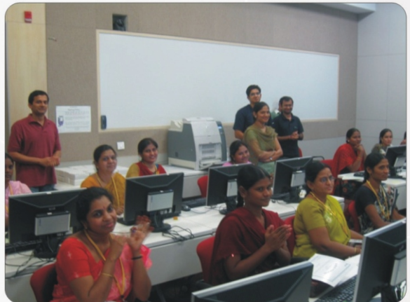
Ashray Akruti teachers attending the workshop at Microsoft