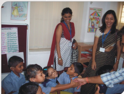
Delegates of IIPH Workshop