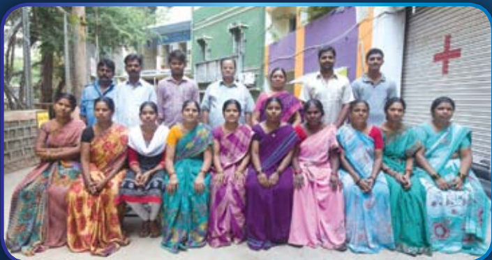
Support Staff Srinagar Colony