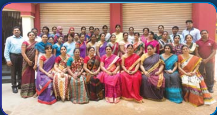
Teaching Staff Srinagar Colony