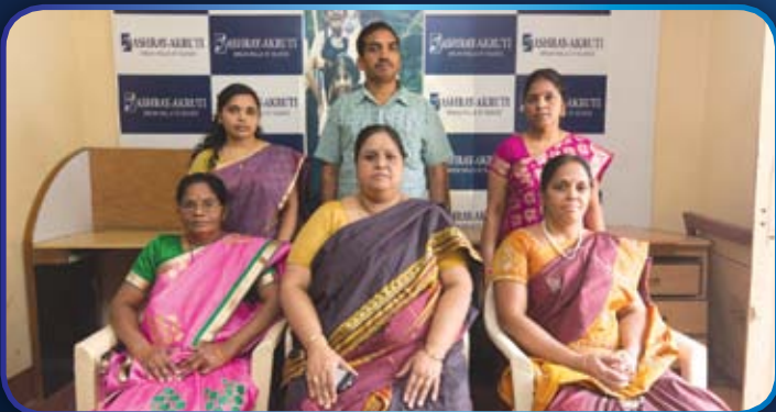
Residential Home Staff