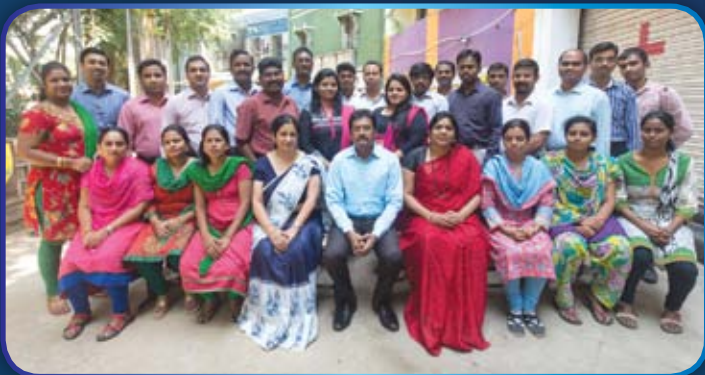
Administrative Staff Srinagar Colony